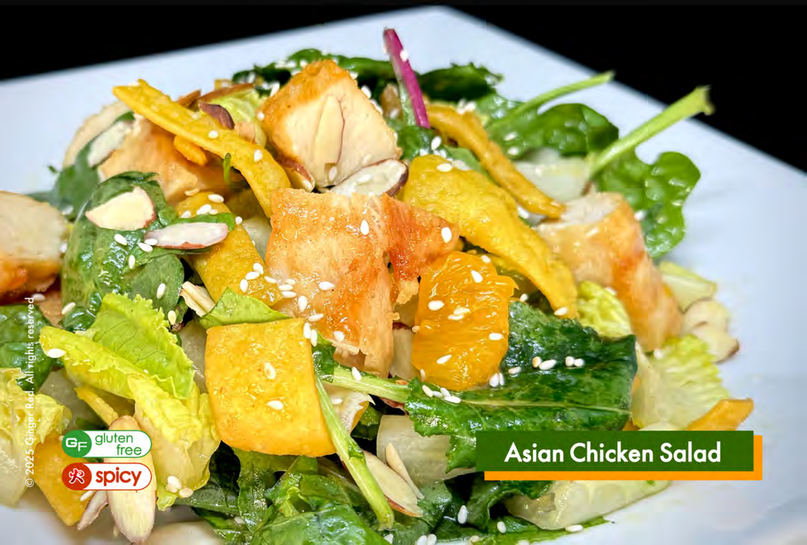
Asian Chicken Salad