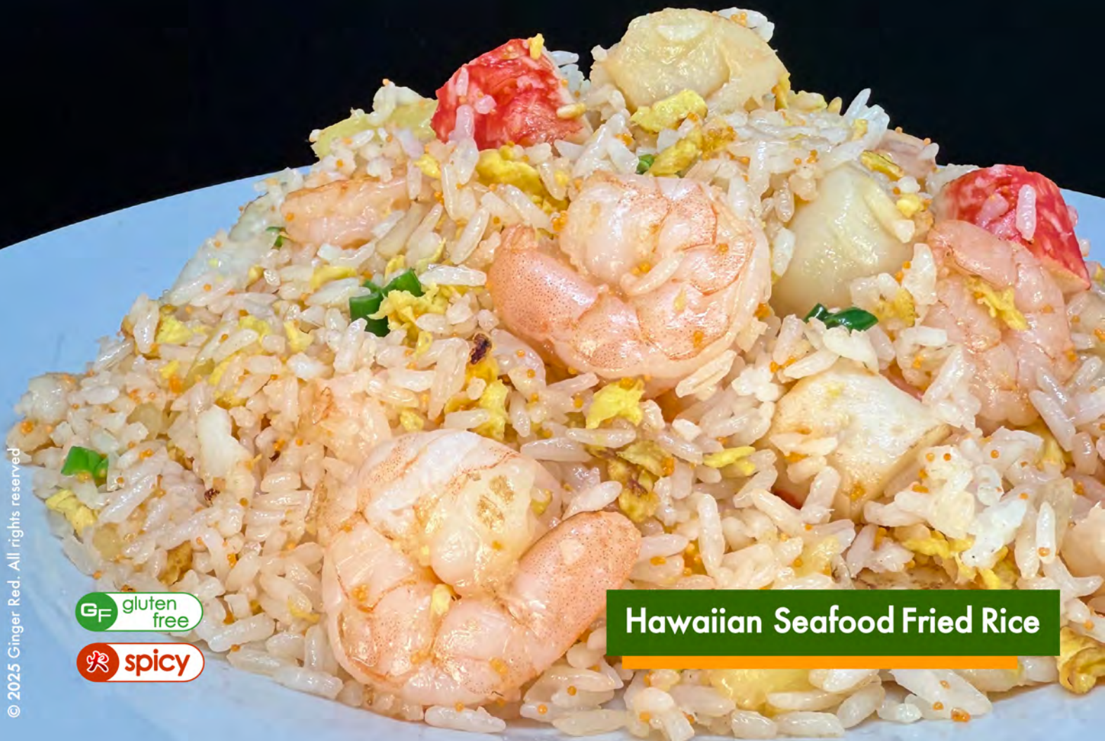
Hawaiian Seafood Fried Rice

chicken 12.95 seafood (scallops, shrimp & imitation crab) 13.95